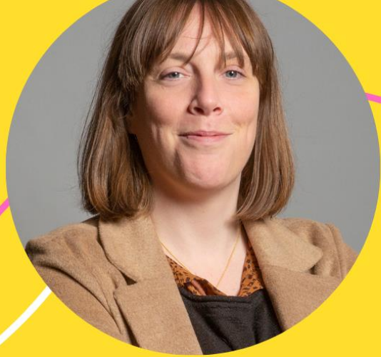
Jess Phillips Speaker